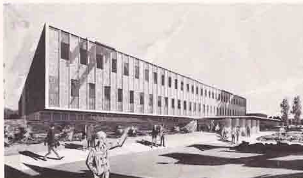
New Library Building (under construction)

BYU was founded by Brigham Young as an academy in October 16, 1875 under the leadership of Karl G. Maeser. In 1903 the school became a university. It is owned and operated by the Church of Jesus Christ of Latter-day Saints (commonly called Mormon). It is the headquarters of the Church's widespread educational system.