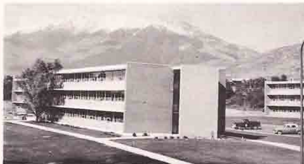
Helaman Halls (men's residence)