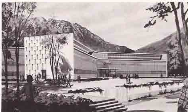
New Administration Building (under construction)

Total daytime enrollment for 1959-60 was 11,842; this is more than double the enrollment of ten years ago. Expected enrollment should reach 15,000 by 1965, and 22,000 by 1970. Fifty-five per cent of the students come from outside Utah, including the 50 states and 45 foreign countries. Membership in the Church of Jesus Christ of Latter-day Saints is not required for admission, although at the present time 95 per cent of the students are members. The other five