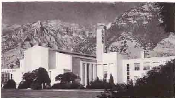
Joseph Smith Memorial Building

Brigham Young University, which is located on 500 acres in the northeast section of Provo, is in the heart of Utah Valley. Provo is the third largest city in Utah. When joined with Orem, (the city to the immediate north) it is classified by the federal government as a "standard metropolitan statistical area." That is, it has a twin city population of at least 50,000. Latest figures released by the government list the population of Provo-Orem area as 106,777 persons, more than half of whom reside within the central cities. Utah Valley is bordered on the west by Utah Lake, on the north by 14,000-foot Mt. Timpanogos, and the east by the Wasatch Mountain Range. Population within the Valley is over 115,000.